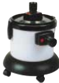
WP312M (A or B) Plastic Wet Pick-Up Bucket including cart, hose and cuffs. Approx. 4 gallon capacity