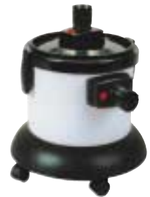
ICC-302B Restaurant Interceptor Approx. 4 Gallon Capacity Supplied with hose and cuffs ICC-302 Restaurant Interceptor Supplied with NO hose or cuffs

A Style = 1-1/4" Connections B Style = 1-1/2" Connections