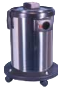
CWP-332M (A or B) Stainless Commercial Wet Pick-Up. Includes MC-32 Mobile Cart, hose and cuffs. Approx. 5 gallon capacity