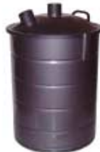
CWP-132 Galvanized Commercial Wet Pick-Up Approx. 8 Gallon Capacity