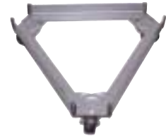
MC-125 Flat Triangular Dolly Will fit all galvanized cans