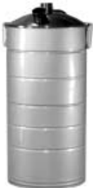
ICC-210 Interceptor Approx. 10 Gallon Capacity 2" Connections Only **To connect use IH-301 hose and hose clamps**