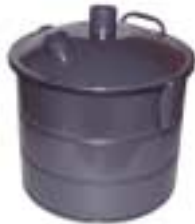
WP-112 Galvanized Wet Pick-Up Approx. 4 Gallon Capacity