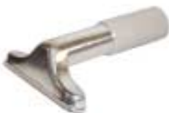
IW-223 Handi-Tool for 1-1/4" Hose (NOTE: Handi-tools fit directly on hose)