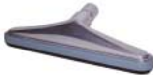
ISV-645 14" Metal Squeegee (Fits S-Wands)