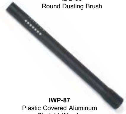
IWP-87 Plastic Covered Aluminum Straight Wands