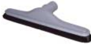
IFB-535 14" Plastic Floor Brush (Fits S-Wands)