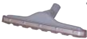
IFB-001 14" Wide Felt Floor Brush (Use with W-219 Wands)