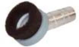
IDB-306 Metal Heavy Duty Dusting Brush 1-1/4" and 1-1/2" (Use IHV-159 & IHV-160 Cuffs for 1-1/2" & HC-111 Cuff for 1-1/4" )