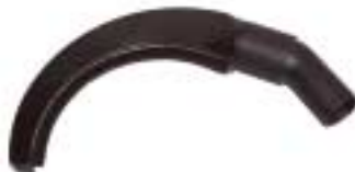
PDB-200 Plastic Pipe Dusting Brush for 6 inch pipe (Fits W-218RG and W-219 Wands)