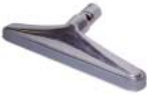
IRT-646 14" Metal Rug Tool (Fits S-Wands)