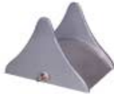
SSS-186-4 Hose Hanger SSS-186-4-S Hose Hanger with Switch