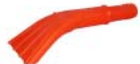
IUT-200 Upholstery Car Tool - Orange color with wide mouth (Fits IHV- 159, IHV-160, and HC-111 Cuffs)