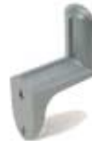
H-431 New Plastic Hose Hanger