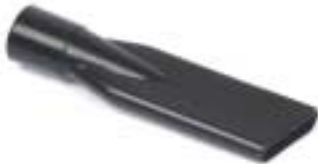
ICT-003 Short Crevice Tool