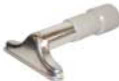
IW-224 Handi-Tool for 1-1/2" Hose (NOTE: Handi-tools fit directly on hose)