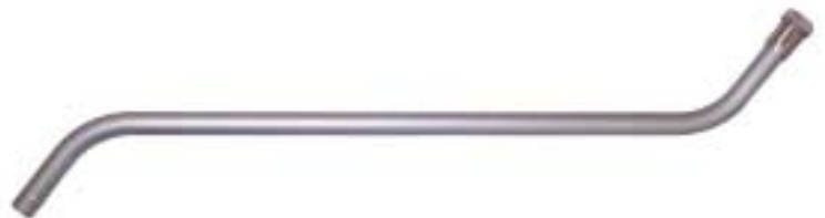
IWA-24 48" Double Curved Industrial Aluminum S-Wand Fits IHV-159 (1-1/2") and HC-111G (1-1/4") Cuffs