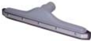
ISV-545 14" Plastic Squeegee (Fits S-Wands)