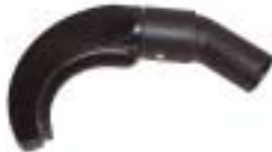
PDB-100 Plastic Pipe Dusting Brush for 3 inch pipe (Fits W-218RG and W-219 Wands)