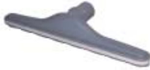
IFB-535-M 14" Plastic Rug Tool (Fits S-Wands)