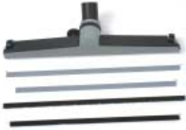
FBA-400 18" Adjustable Plastic Rug Tool with Hard Floor and Squeegee Inserts (Fits IWP-87 Wands)