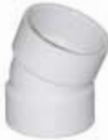
PF-309 22-1/2° Ell 3 x 3