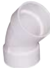
PF-316 45° Ell 3 x 3 EL-351 Steel 45° Ell