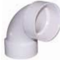
PF-312 90° Short Radius Ell 3 x 3