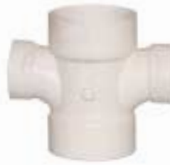
PF-335 90° TY 3 x 3 x 2 x 2