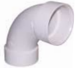
PF-313 90° Sweep Ell 3 x 3 EL-352 Steel 90° Sweep Ell