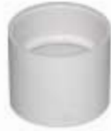
PF-302 3 x 3 Coupling SF-353 Steel Slip Coupler