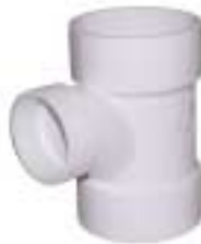
PF-325 90° TY 3 x 3 x 2 TY-355 Steel 90° TY