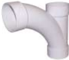
PF-311 SWEEP 90° TY 3 x 3 x 3