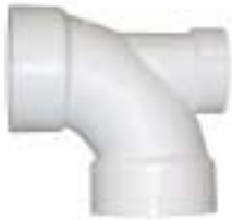
PF-305 90° TY 3 x 2 x 3