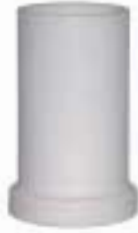
PF-301 Expansion Coupler

NOTE: For 3" Plastic Fittings, PF-226 Adaptors are included for each 2" bell.