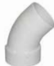
PF-342 45° Street Ell