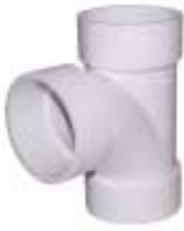
PF-315 90° TY 3 x 3 x 3 TY-358 Steel 90° TY