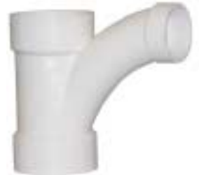
PF-321 Sweep 90° TY 3 x 3 x 2