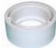
PF-317 Reducer Bushing 3 x 2 RC-3541 Steel Reducing Coupler