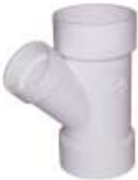
PF-324 45° TY 3 x 3 x 2 YL-3551 Steel 45° TY