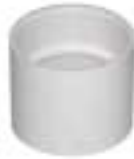
PF-228 2" I.D. Couplers for Schedule 40 PVC Pipe