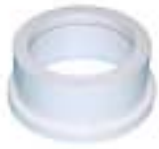
PF-226 Adaptor 2" I.D. Pipe to 2" O.D. Vacuum Tubing - Used on 3" x 2" fittings