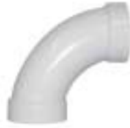
PF-229 2" I.D. 90° Sweep Ell for Schedule 40 PVC Pipe