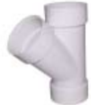
PF-231 2" I.D. 45° TY for Schedule 40 PVC Pipe

NOTE: See Residential Catalog for Standard, 2" PVC Fittings, Remote Control Wire, and Standard Accessories.