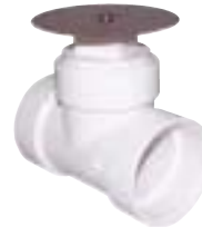
PF-230 2" I.D. Clean-Out Plug Assembly for Schedule 40 PVC Pipe