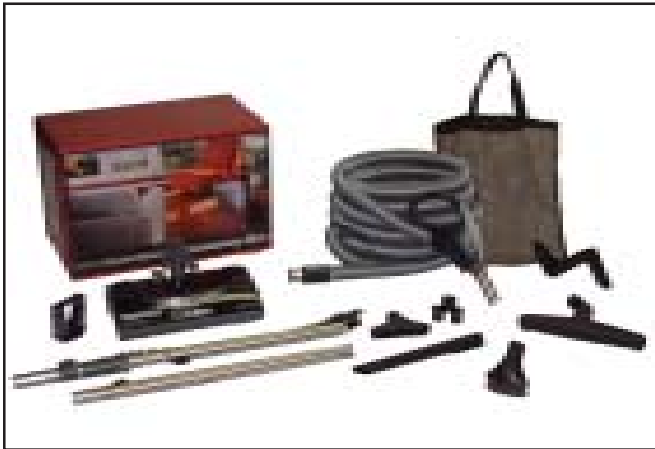
*VSP1S--Direct Connect, VSP2S--6 Ft. Pigtail Cord