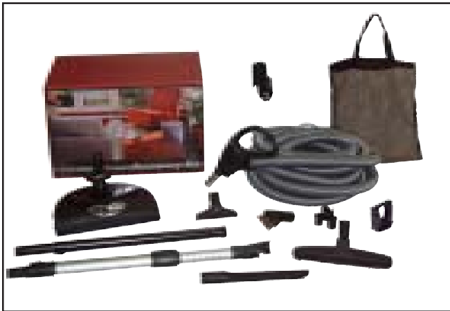
*PEK1--Direct Connect, PEK2--6 Ft. Pigtail Cord